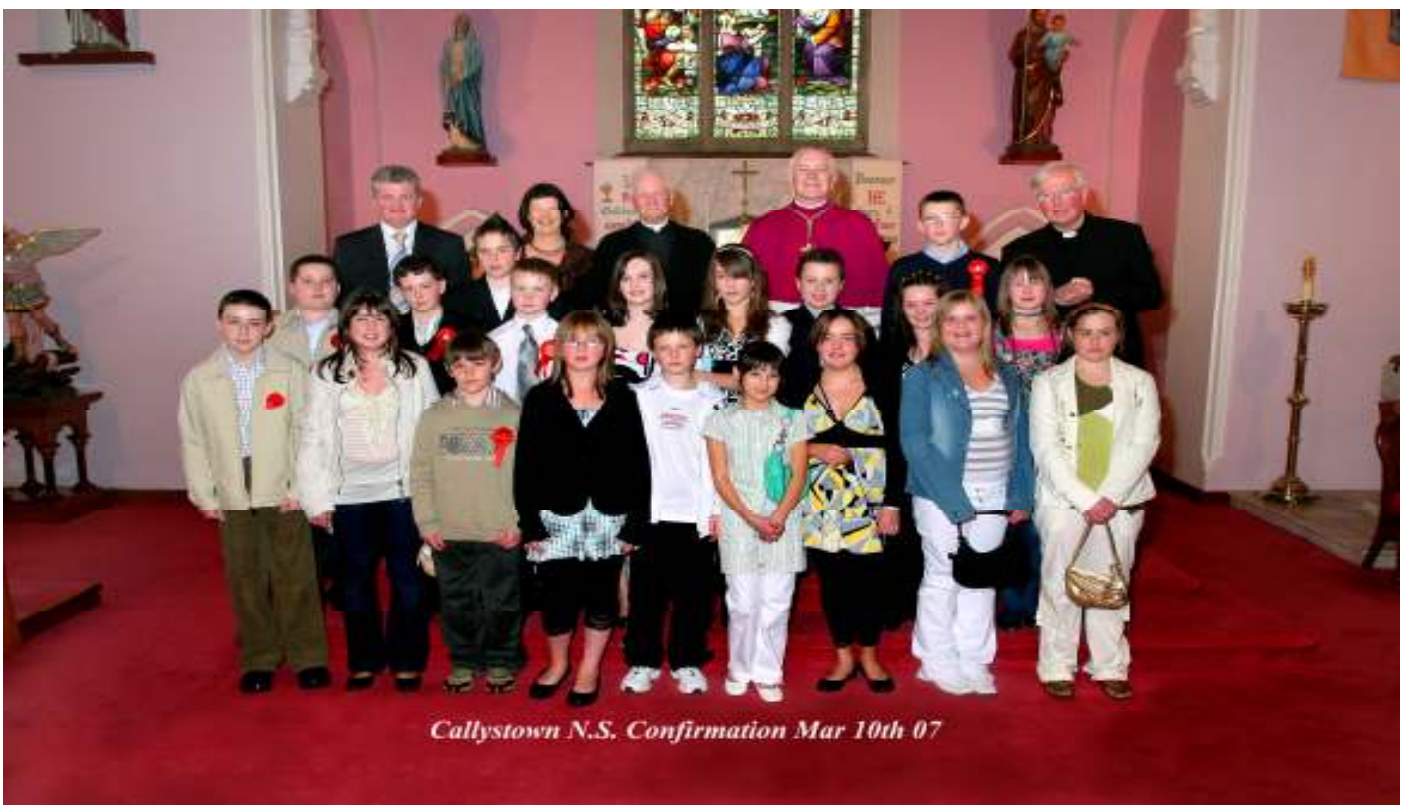
Callystown N.S. Confirmation Mar 10th 07